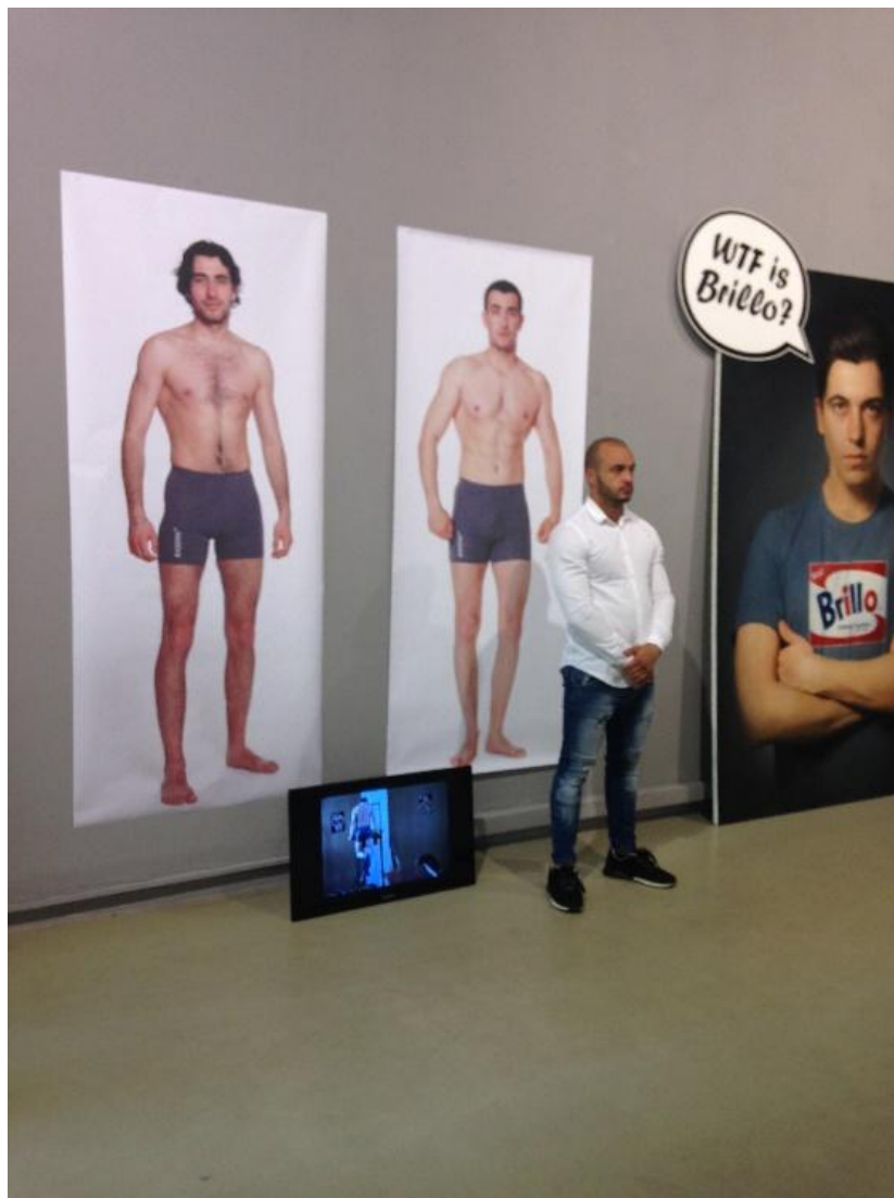
Installation view, Yuzina Gallery, Sofia 2018

Edition 1/3 in the collection of the Sofia City Gallery, Sofia